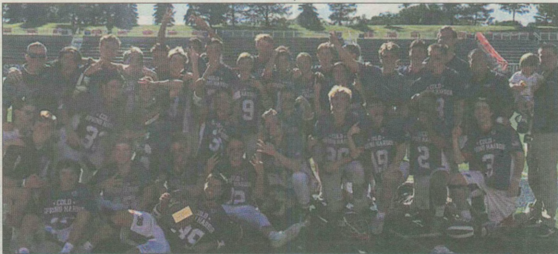
The Cold Spring Harbor boys lacrosse team is pictured after winning its third-consecutive Long Island Class C Championship title last weekend.

"A Commitment to Excellence"